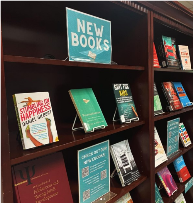
New Books Display