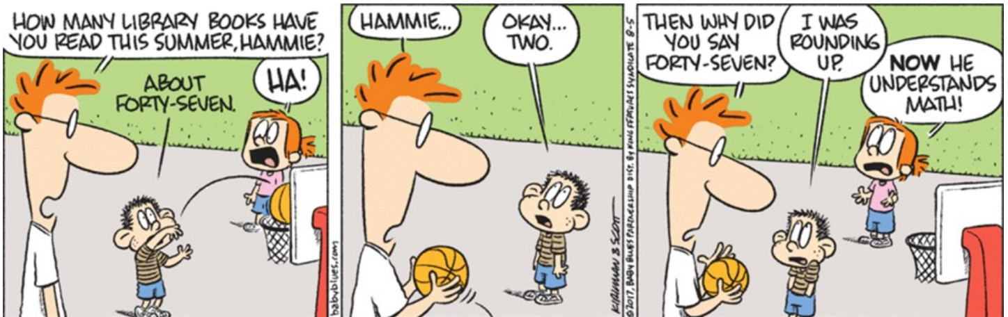
Image from https://nebusresearch.wordpress.com/2017/08/07/reading-the-comics-august-5-2017-lazy-summer-week-edition

Here's a little library-themed comic for you... Enjoy!