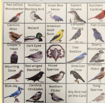
Top: An example Bird Bingo card—can you find them all?