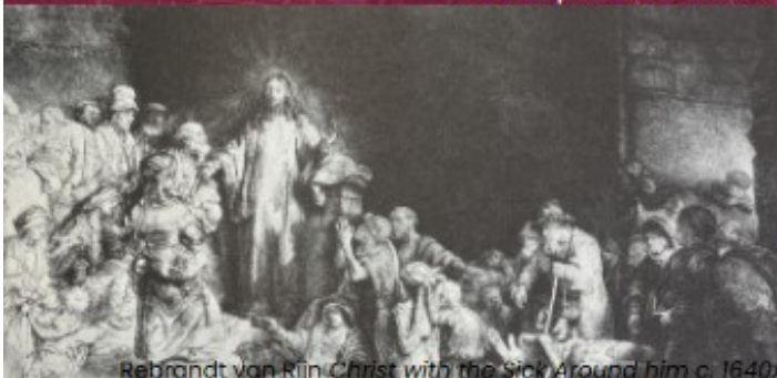
Rebrandt van Rijn Christ with the Sick Around him c. 1640x