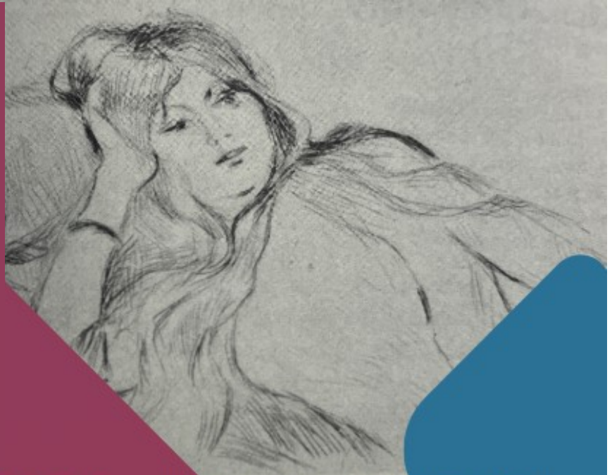
Berthe Morisot Woman Reclining Upon a Couch

During Homecoming Week (October 9-12), we will give out free copies of Selected Prints from the Goebel Collection at Eastern College . The book details the Goebel Print collection that the university hosts in the library's special collections. Until supplies run out!