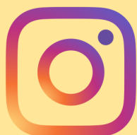
Illustration: Tom Gauld / The Guardian

Keep in touch with all the library's updates on the following social media!